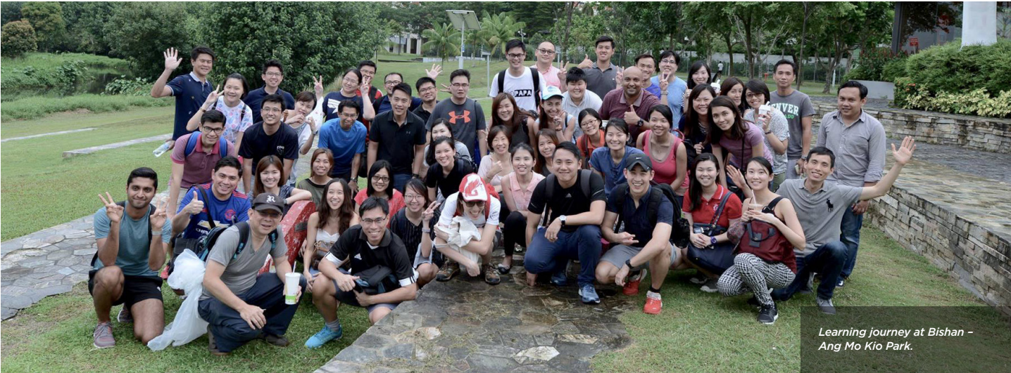
Learning journey at Bishan - Ang Mo Kio Park.

Foundation programme for officers in Infrastructure & Environment Sector